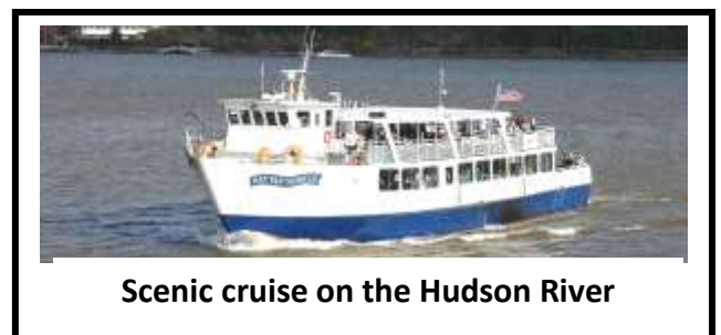
Scenic cruise on the Hudson River

After lunch you will enjoy a scenic, narrated cruise along the Hudson River, itself a storehouse of historic events. You will sail along the route that Henry Hudson travelled 400 years ago.