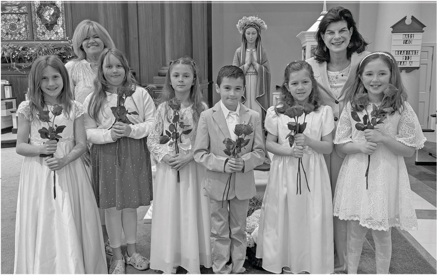
Participants from our Faith Formation First Communion Class Crown Mary on Mother's Day